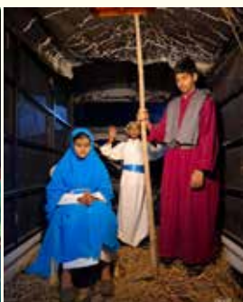
A skit recreating the Christmas magic