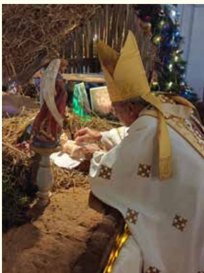
A divine welcome to the Prince of Peace born in a manger