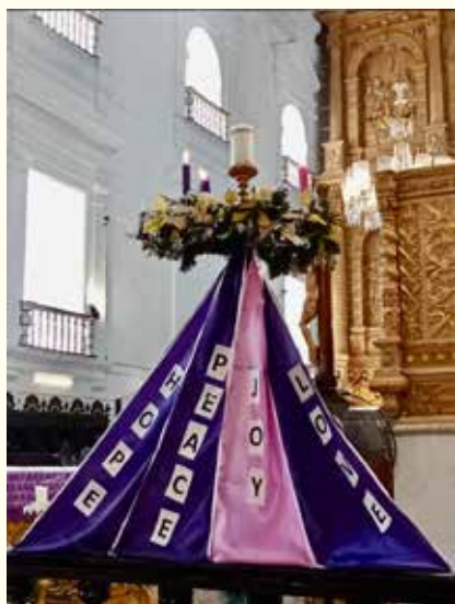
Lighting the way to New Beginnings with hope, peace ,joy and love